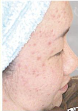
BEFORE — Acne scars