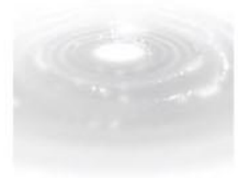
JBP Placental Extract moisturizing ingredient