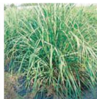
Natural lemongrass oil natural perfume