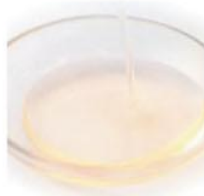
Natural fatty acid(vegetal) cleaning ingredient