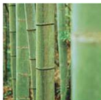
Bamboo vinegar skin conditioner