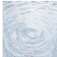
Water glycolic acid corneum softner